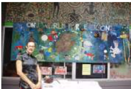
Recycled Artwork 'One World for Everyone'

The Fox St Pre-School Carnivale is held each year and is the school's main fund raiser. A large colourful mural created by the children using recycled objects on a recycled canvas was on display and highlighted the Carnivale theme of 'One World for All'.