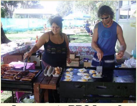
Low waste BBQ Lunch